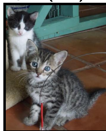
Magic and Milo (above)

These kitties came to us either as orphans or were homeless.