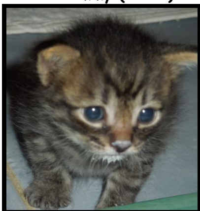
Timmy Milk Face (above)